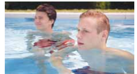
Henry Gamble's Birthday Party

Producing a film doesn't have to be an expensive, multi-million-dollar project. Three independent filmmakers talk about their experiences creating successful films without breaking the bank.