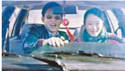
Mountains May Depart

6:00 PM-7:00 PM – Loews Hotel (455 N. Park Dr.)