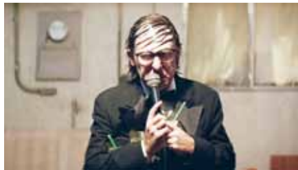
Entertainment , Magnolia Pictures